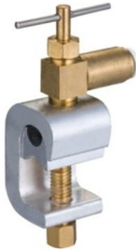
Figure 2. Self-Piercing Inlet Saddle Valve

The self-piercing saddle valve is designed for use with 3/8" to 1/2" OD soft copper supply tubing.