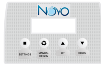
Figure 1. Key Pad Configuration