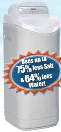
Novo 485 Cabinet Softener

* Water Quality Research Foundation Studies (2010 Detergent savings study, 2009 Energy Savings Study)