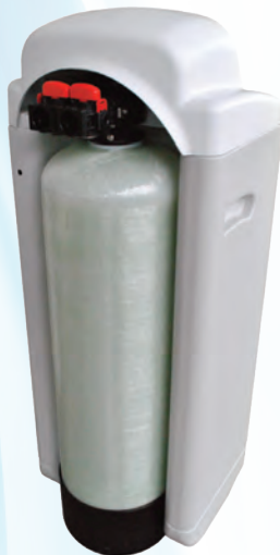
Two piece cabinet design