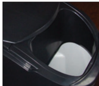
Easy-slide cover design