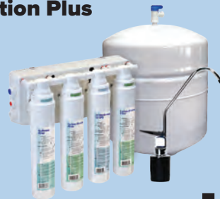
Aqua Flo Platinum QCRO4V-50*