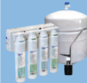
Aqua Flo Platinum QCRO4V-50*